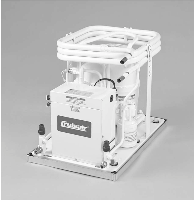
FX24C3-P Condensing Unit Shown